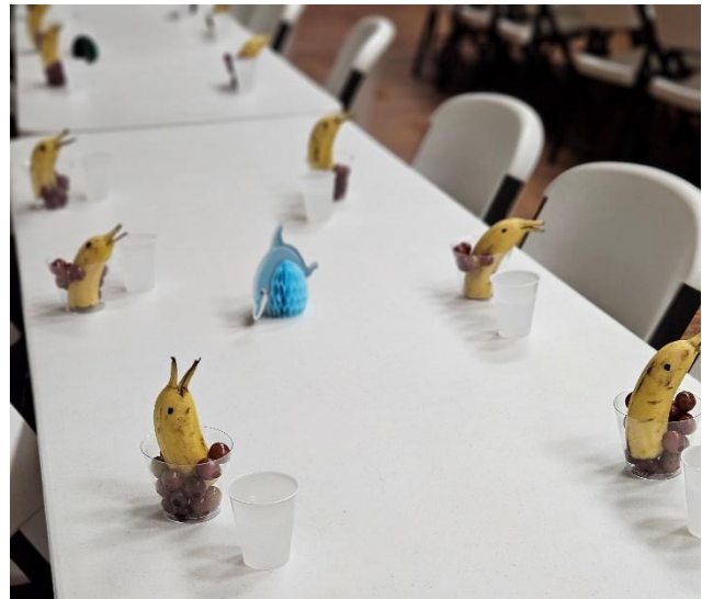
Joyous opening action each morning!